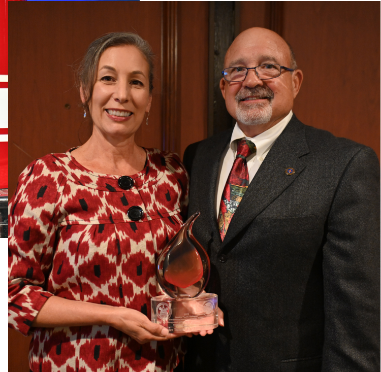
Greater Tucson Fire Foundation Sarbanes Award