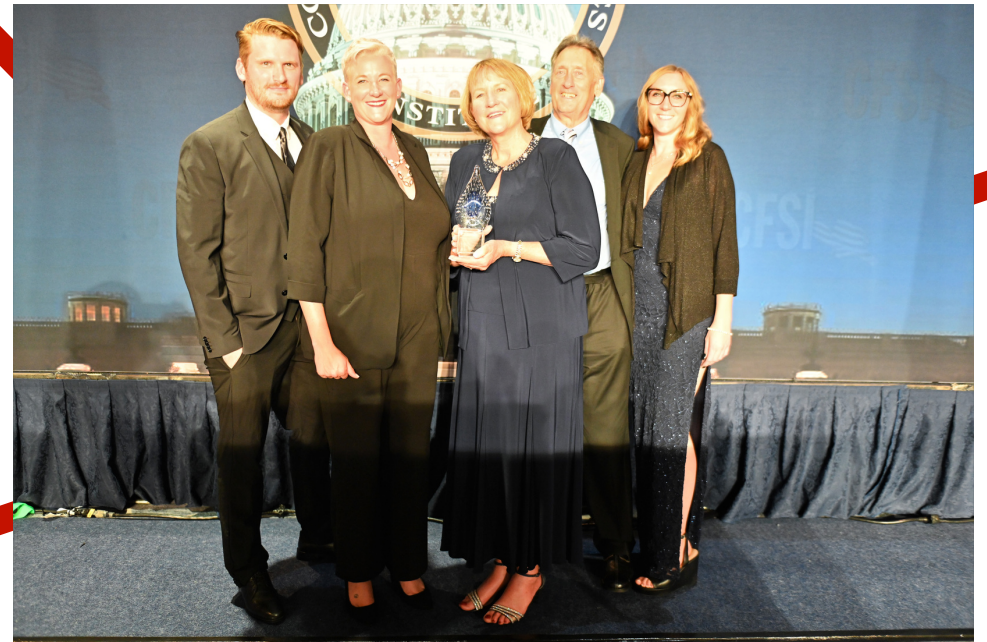
Peg Paul Phillips Award