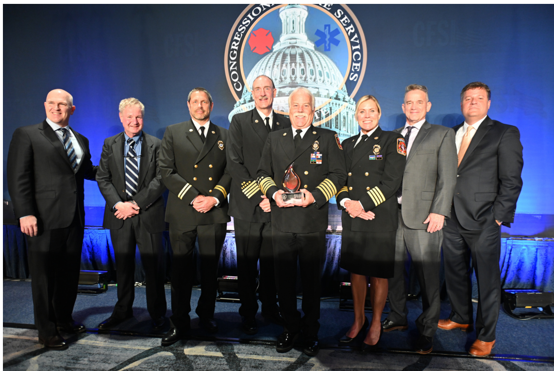
Colorado Springs Fire Department Excellence in Fire Service-Based EMS Award